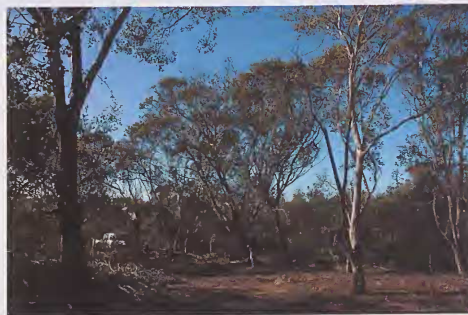
Figure 6. Ten metre tall grove of very old E. nutans with Bremer Bay identity Don Scott providing a 1.9 metre scale.